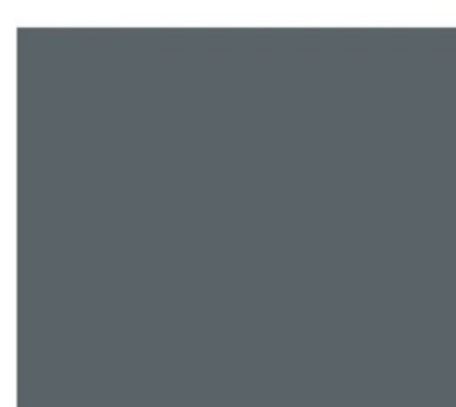
Grays Harbor Paint View at Sherwin Williams