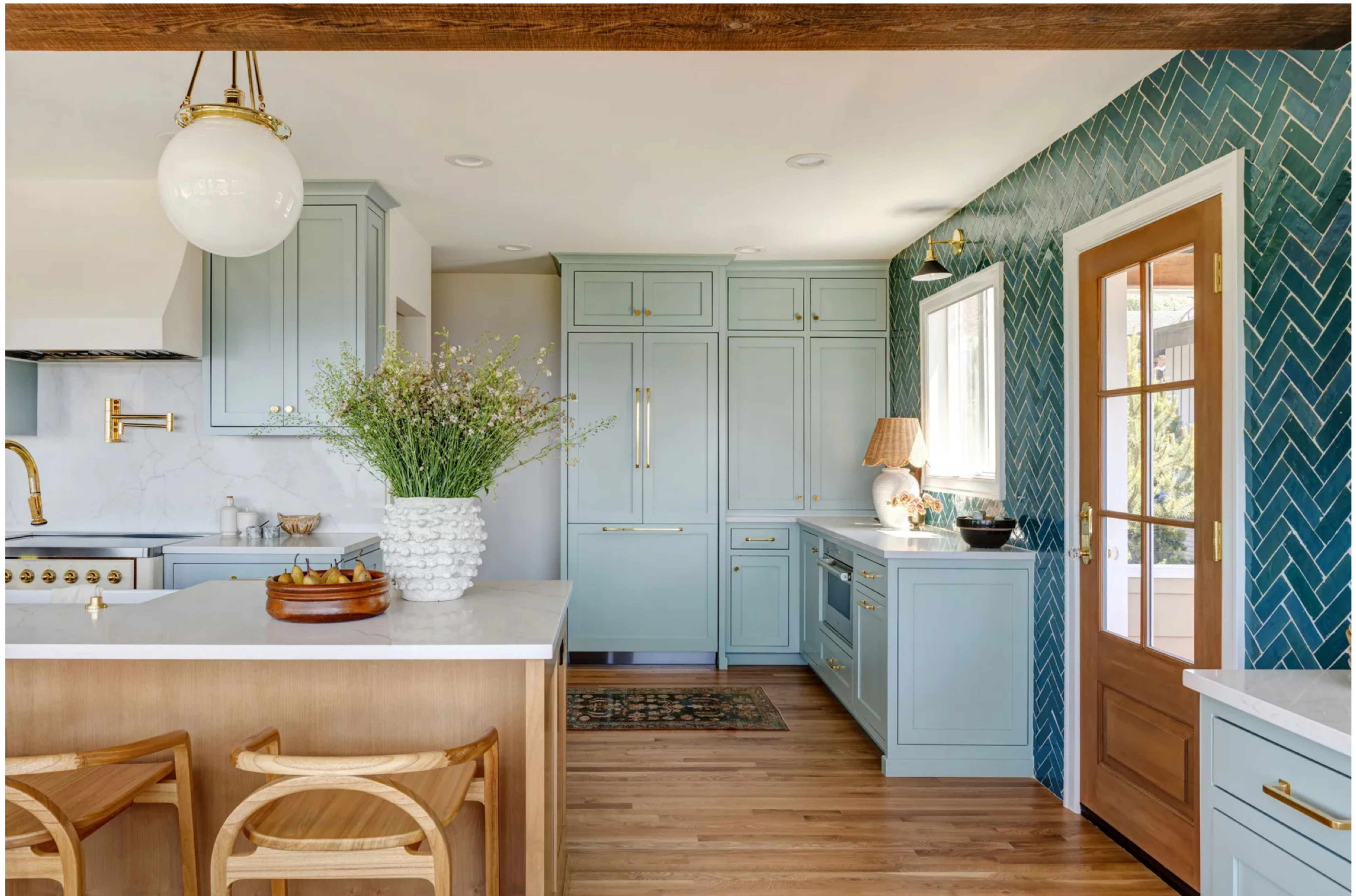
(Design: Cohesively Curated Interiors)